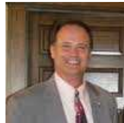
Joe Jaynes Collin County Commissioner Precinct 3